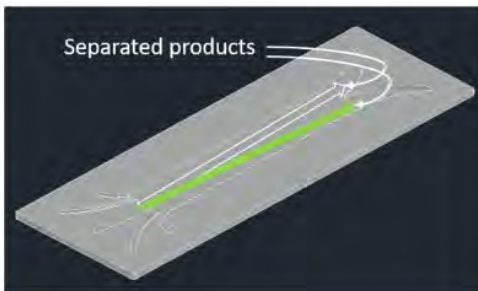
With electrical field